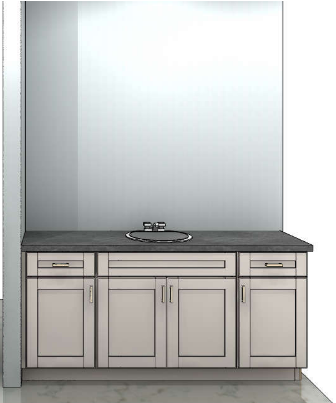
2ND FLOOR BATH 2