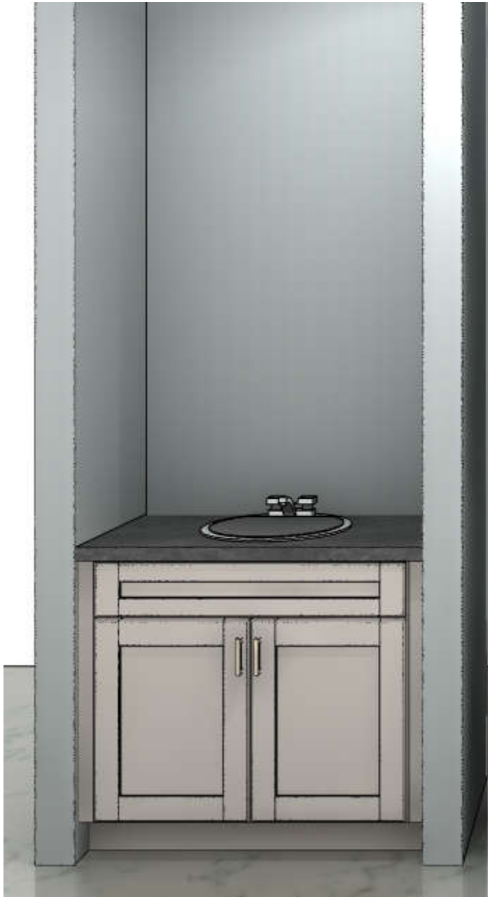
1ST FLOOR BATH